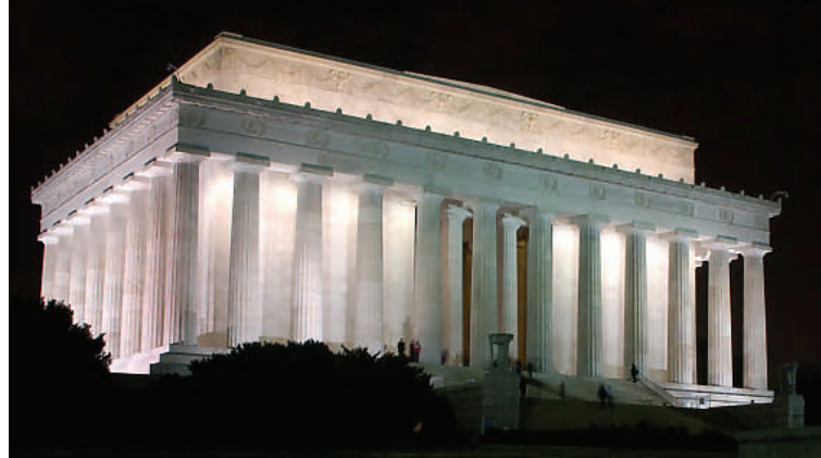
Lincoln Memorial - taken during the UIA Moonlight Tour.